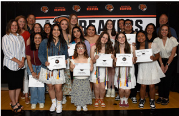
Class of 2024 Core Values Scholarship recipients.

BHSSF awarded over $150,000 in scholarships to graduating seniors based upon need, and also for students who exemplified Beaverton High School's core values of Excellence, Learning, Community and Tradition.