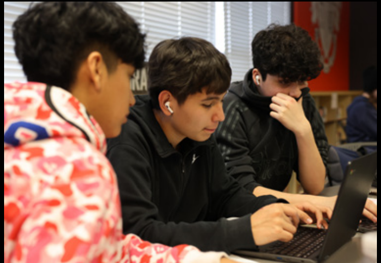
The BHSSF supports AVID students with cost free laptops to all graduating, college bound seniors.