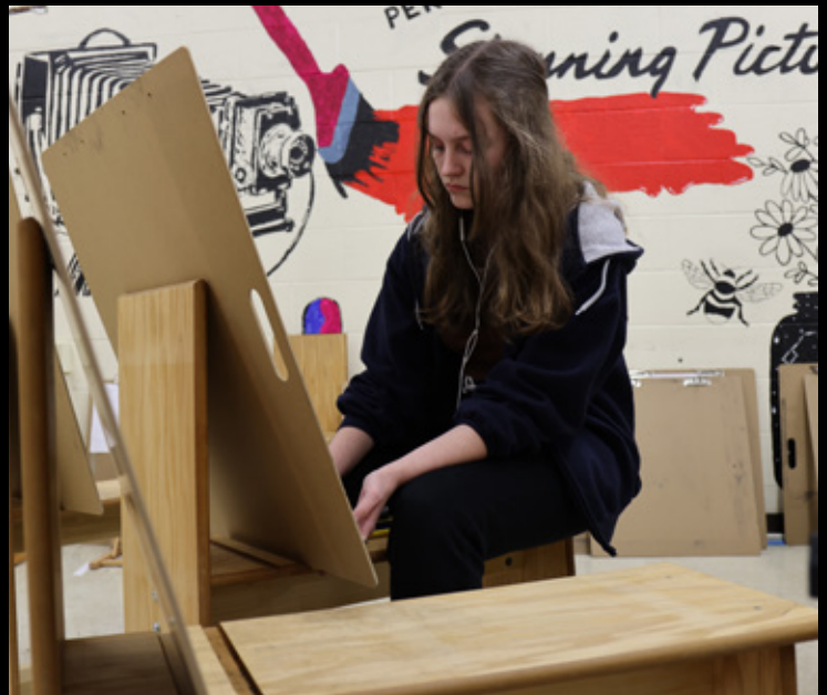
Class and activity fees are underwritten by the BHSSF to encourage students to explore options and become more fully involved in their school community.