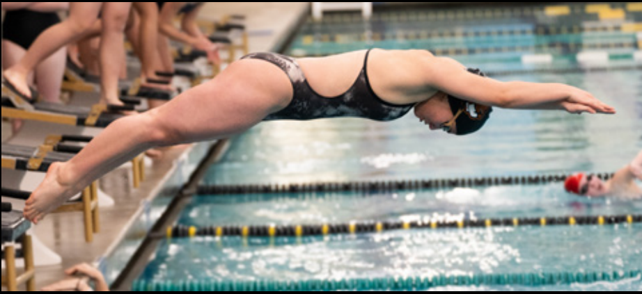
The BHSSF subsidizes athletic participation fees, allowing more students to participate in athletics.