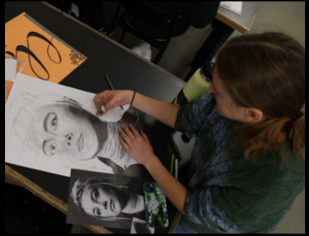
Art fees are supported by the BHSSF, to help more students experience art education.