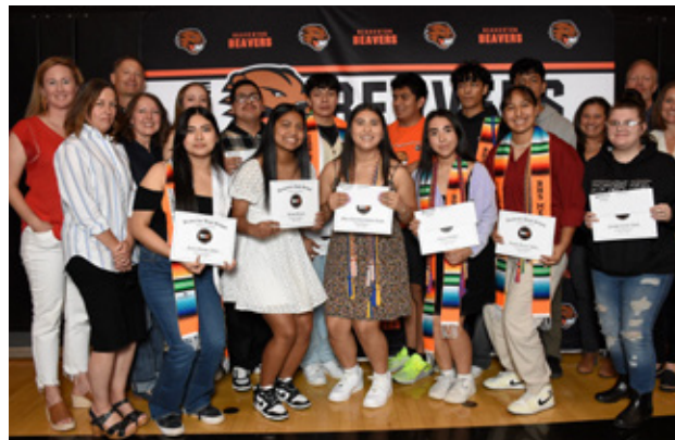
Class of 2024 Success Fund Scholarship recipients.