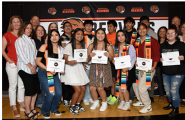
Class of 2024 Success Fund Scholarship recipients.