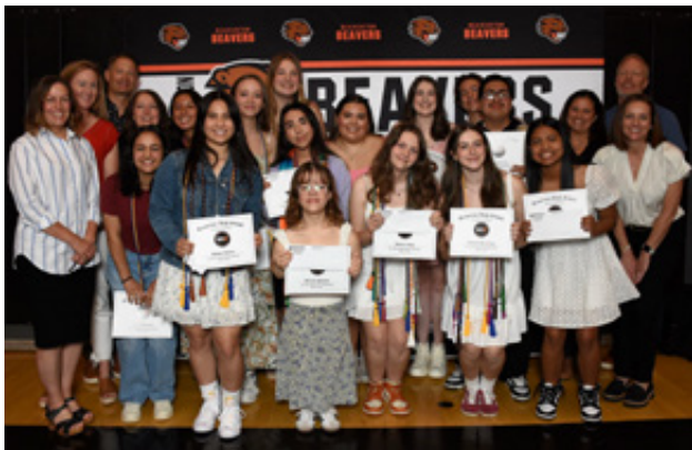
Class of 2024 Core Values Scholarship recipients.

BHSSF awarded over $150,000 in scholarships to graduating seniors based upon need, and also for students who exemplified Beaverton High School's core values of Excellence, Learning, Community and Tradition.