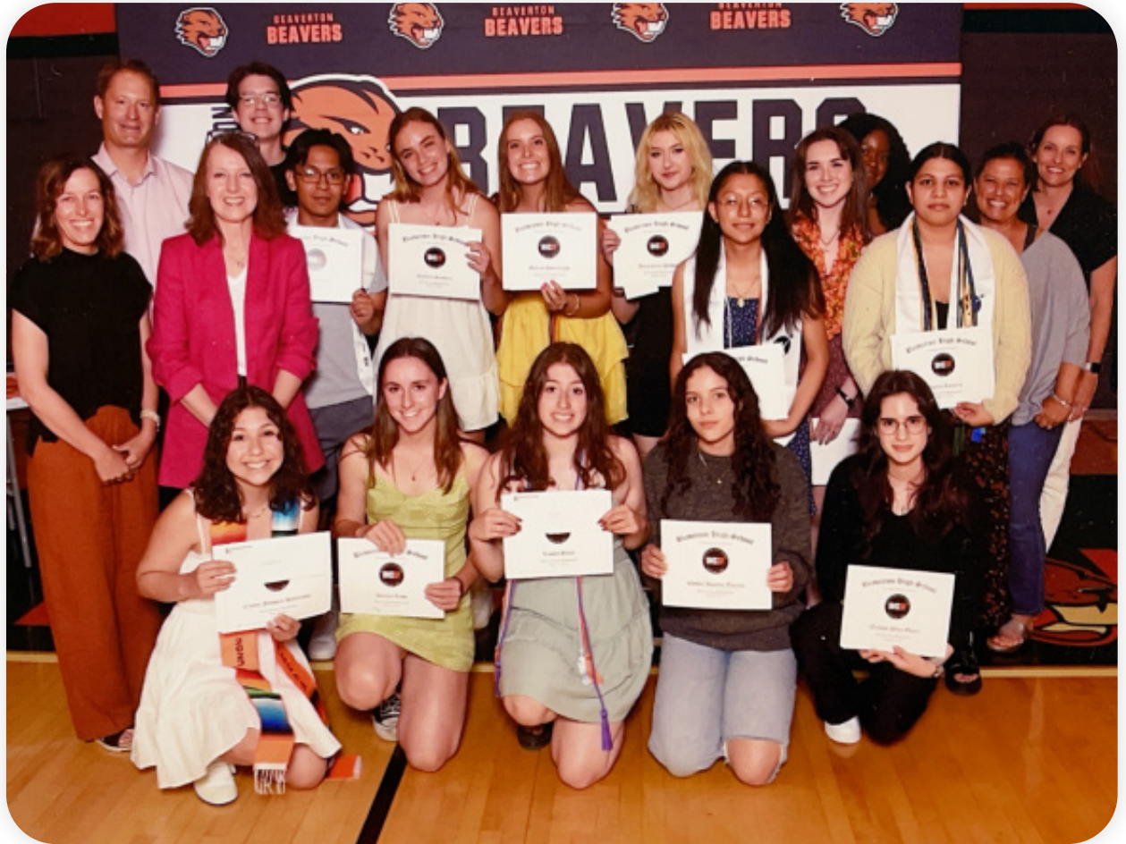
The Class of 2023 Success Fund Scholarship winners

BHSSF awarded over $152,000 in scholarships to graduating seniors based upon need, and also for students who exemplified Beaverton High School's core values of Excellence, Learning, Community and Tradition.