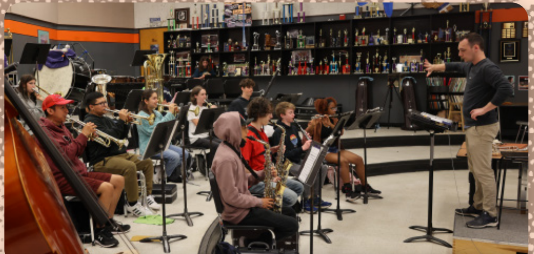
Class and activity fees are underwritten by the BHSSF to encourage students to explore options and become more fully involved in their school community.