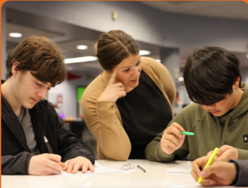
The BHSSF supports AVID students with cost free laptops to all graduating, college bound seniors.