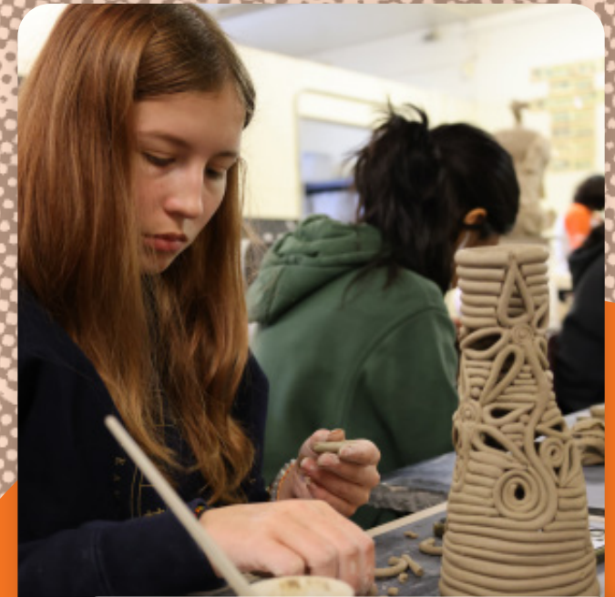
Art fees are supported by the BHSSF, to help more students experience art education.