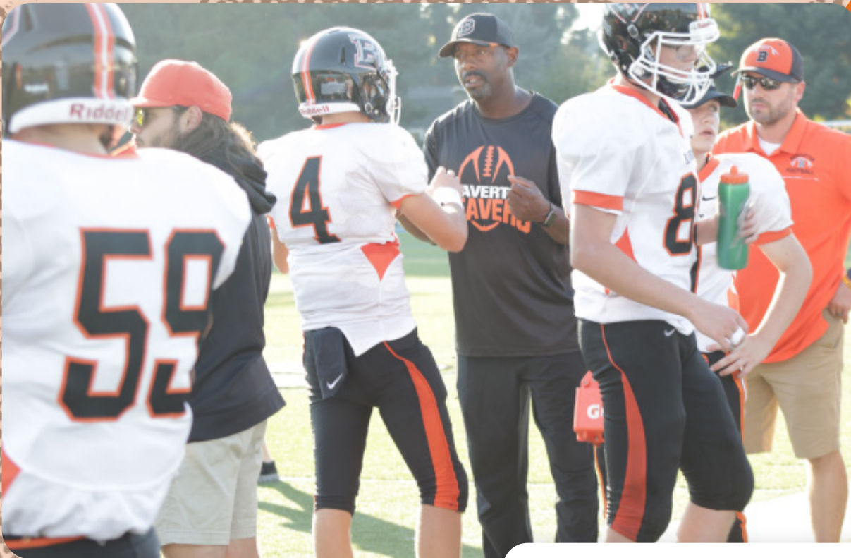
The BHSSF subsidizes athletic participation fees, allowing more students to participate in athletics.