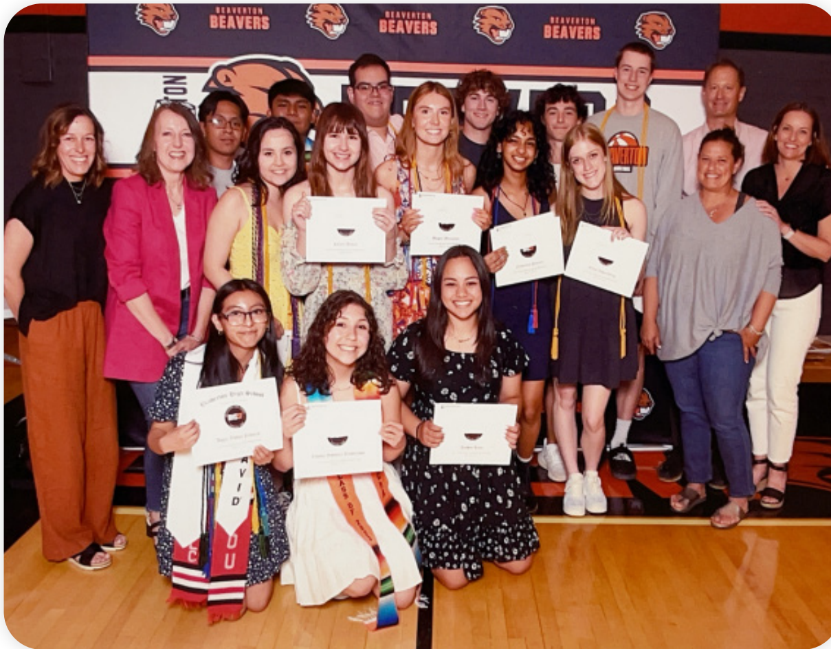
The Class of 2023 BHS Core Values Scholarship winners